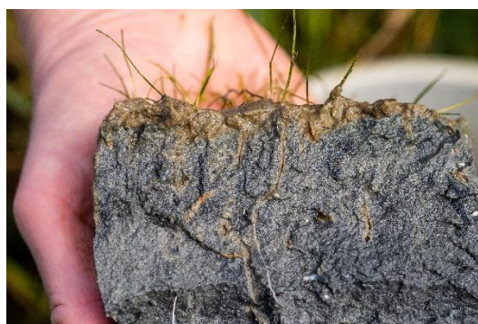
Photo 1: Polychaete worms' sample. Photo 2: Burrows formed by polychaete worms.